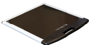
Protective detector holder