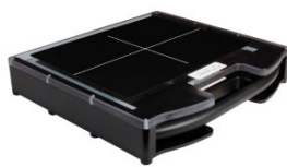
Equine weight bearing tunnel (Option)