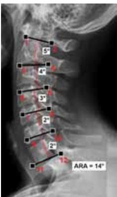
Absolute Rotation Angle