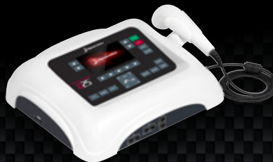
Dynatron 825 3 Channel Combo Unit