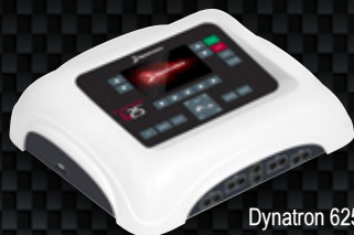
Dynatron 625 5 Channel Stim Unit