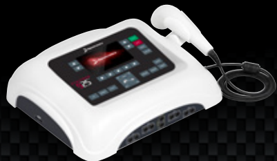
Dynatron 925 5 Channel Combo Unit