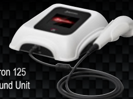
Dynatron 125 Ultrasound Unit