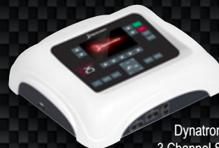
Dynatron 525 3 Channel Stim Unit